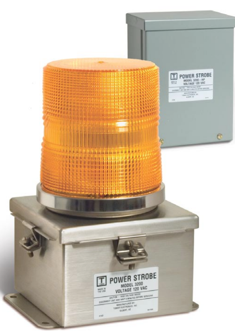
3200 ML with stainless steel enclosure