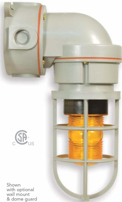
Shown with optional wall mount & dome guard