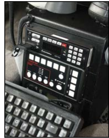
( installed view )